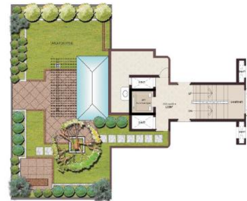
Terrace floor landscape plan